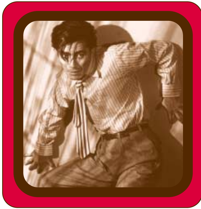
(left) The Films of Michael Powell & Emeric Pressburger: A MATTER OF LIFE AND DEATH (right) Japanese World Classics: DRUNKEN ANGEL