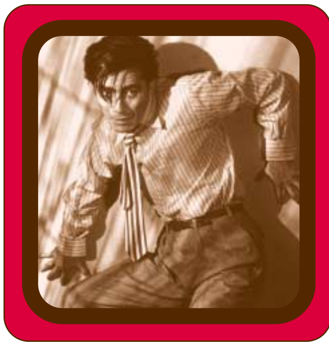
(left) The Films of Michael Powell & Emeric Pressburger: A MATTER OF LIFE AND DEATH (right) Japanese World Classics: DRUNKEN ANGEL