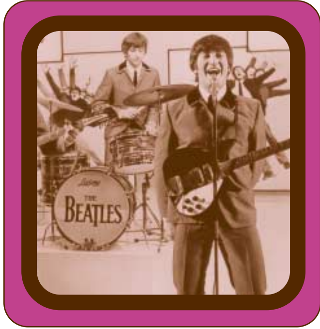
(Left) Giant Monsters on the Loose: GODZILLA 2000 (Right) Mods & Rockers: The Beatles in A HARD DAYS NIGHT