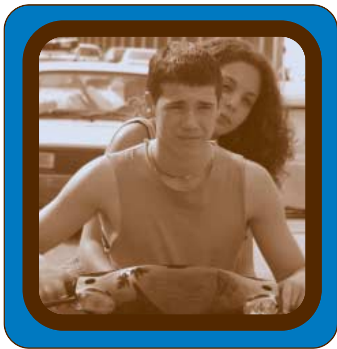
(left) The Golden Age of British Horror: TAKE THE BLOOD OF DRACULA (right) Recent Spanish Cinema: SEVEN VIRGINS