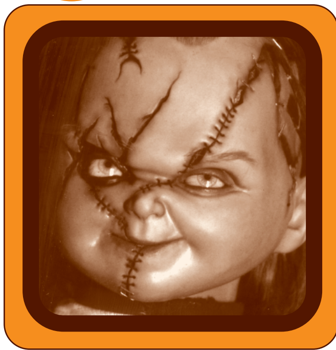
Left: WES ANDERSON IN PERSON. Screen photo: THE DARJEELING LIMITED. Right: Halloween Horror Seed of Chucky.

at the Egyptian & Aero Theatres Advance Tickets: www.fandango.com