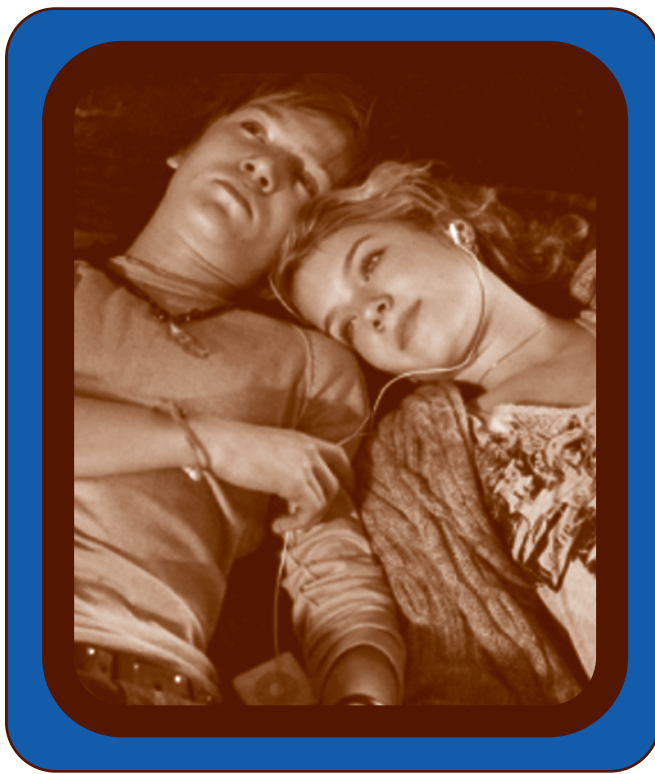
(Left) All Roads Film Festival "Women Hold Up Half the Sky" WHAT WAS PROMISED (film) (Right) German Currents: New Films From Germany: ALL ROADS IN LOVE

American Cinematheque at the Egyptian & Aero Theatres For detailed information: www.americancinematheque.com Advance Tickets: www.fandango.com