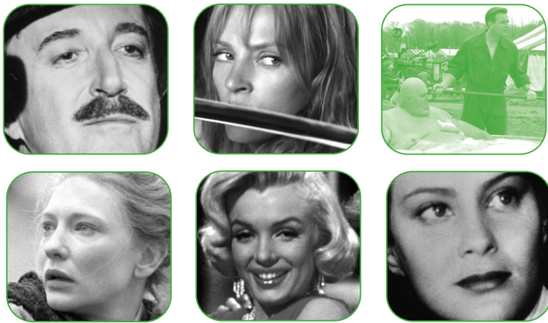
(Top L-R) REVENUE OF THE PINK PANTHER, KILL BILL; BIG FISH (L-R Bottom) THE MISSING; HOW TO MARRY A MILLIONAIRE; WE THE LIVING