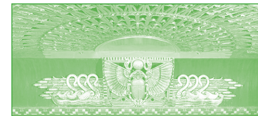
Egyptian Theatre Ceiling

The American Cinematheque is a non-profit 501 (C) (3) organization.