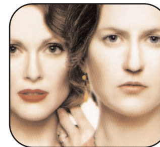
(Top L-R) DEVDAS, GOLDFINGER, CONFESSIONS OF A DANGEROUS MIND (Bottom) A FISTFUL OF DOLLARS, CHICAGO, THE HOURS